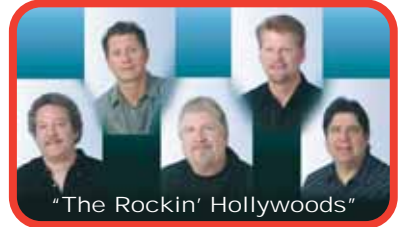
"The Rockin' Hollywoods"