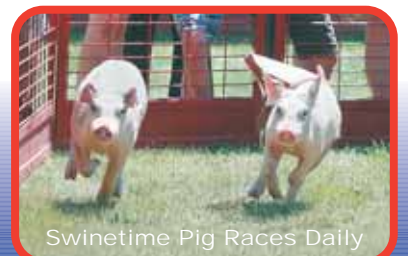
Swinetime Pig Races Daily