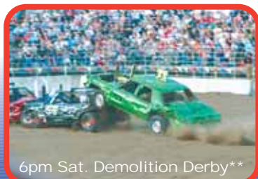
6pm Sat. Demolition Derby**